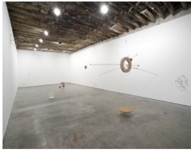
Carlos Bevilacqua, Dois , installation view

If you are out this weekend don't miss Carlos Bevilacqua 's beautiful show Dois at Simon Preston Gallery (301 Broome Street). These precisely balanced and perfectly tensioned sculptures (impressively constructed with no welding or adhesives) give physical coordinates to abstract notions of self-awareness and growth.